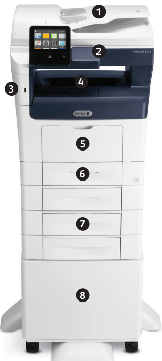
Xerox® VersaLink® B405 Multifunction Printer Print. Copy. Scan. Fax. Email.