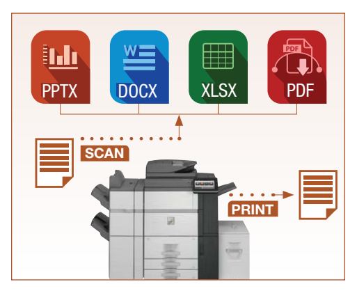
Scan and convert documents to popular file formats seamlessly with Sharp's built-in OCR function.