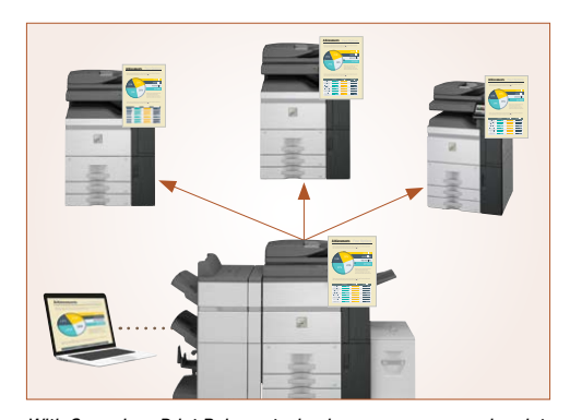
With Serverless Print Release technology you can securely print a job and release it from any of six supported models.<sup>1</sup>