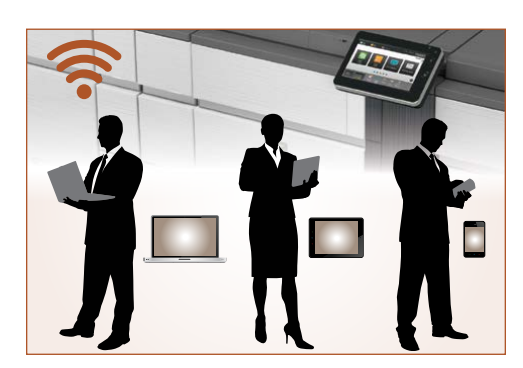
Built-in wireless network interface for convenient scanning and printing from mobile devices.