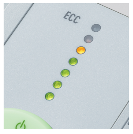
CAPACITY INDICATOR Patented Electronic Capacity Control (ECC) indicator monitors sheet capacity levels during operation to prevent jams.