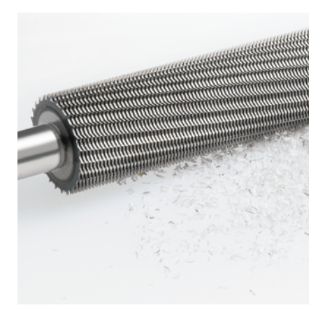
SOLID STEEL CUTTING SHAFTS High grade, hardened steel cutting shafts are milled in our Balingen factory and warranted for life.<sup>1</sup>