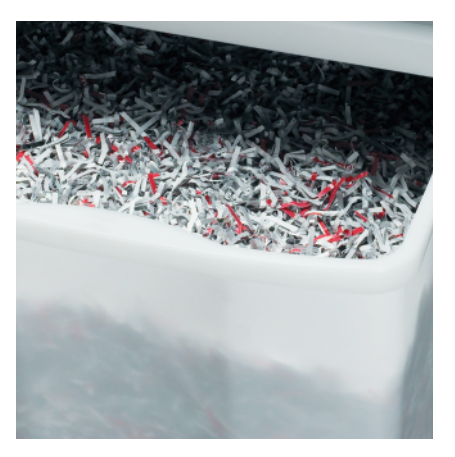
ENVIRONMENTALLY FRIENDLY BIN

On CD capable models, the electronically controlled shield protects the operator from stray splinters of plastic.